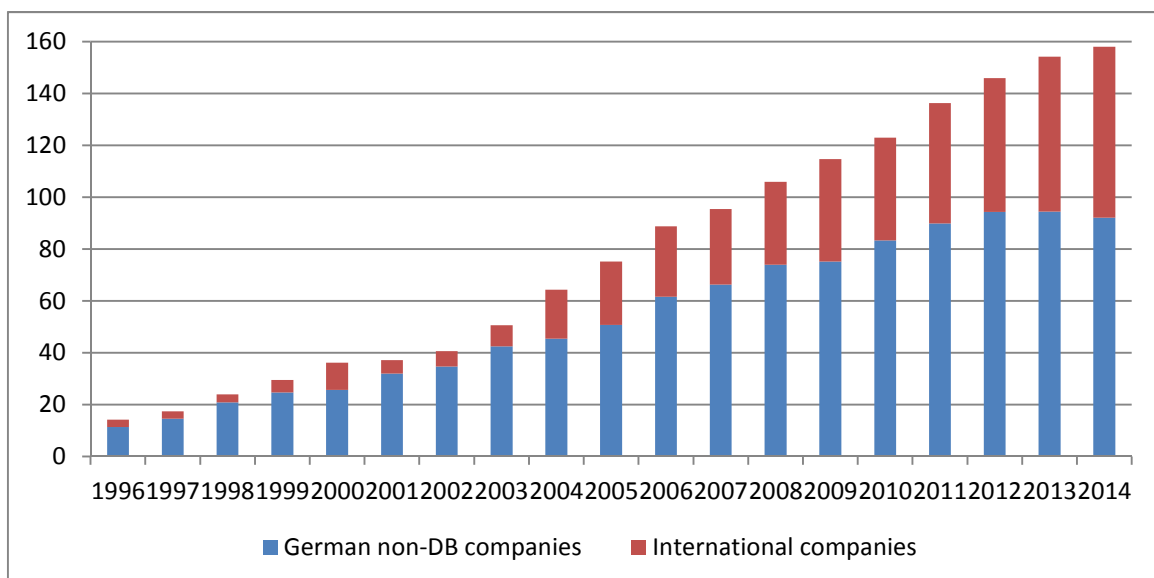
Figure 2: Development of train-km by German and international competitors of DB in regional passenger rail transport in mill. Train-km